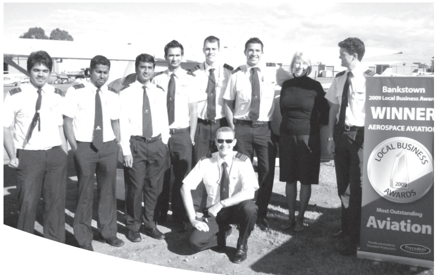
Staff and students at Aerospace Aviation celebrate the company's Business Award win.

For more information about Aerospace Aviation please visit their website - www.aerospaceaviation.com